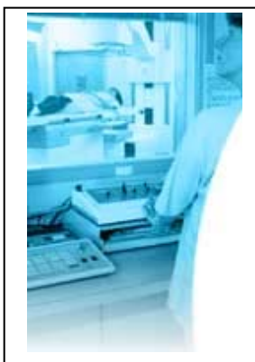
X-ray technicians stand behind radiation barriers when patients are radiated

As a neonatologist, a pediatrician who specializes in the care of premature babies, it has been my privilege for decades to be overseeing the care of thousands of premature infants in several nurseries. In a normal clinical setting, commonly we bring in X-ray machines in order to determine if there are problems in the lungs, abdomen, and bone (my area of research). When the X-ray machine rolls in, and is positioning itself to start the X-ray process, usually all the doctors and nurses step back 6 feet or more away from the baby, since no one wants to be irradiated .